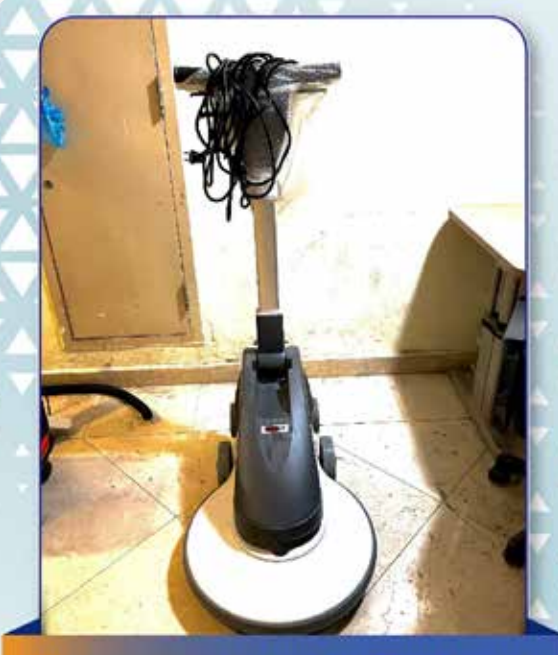
MARBLE BUFFING MACHINE FOR TWIN TOWER